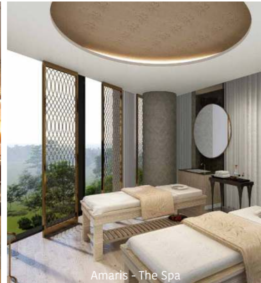
Amaris - The Spa