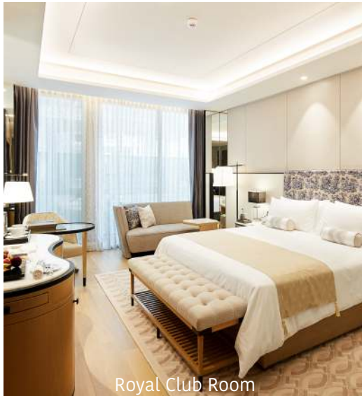
Royal Club Room

The Leela Bhartiya City, Bengaluru has 281 luxurious guestrooms and suites, extensive banqueting, and conferencing venues with multiple dining options. With proximity to uber chic retail outlets, commercial complexes, a centre for performing arts, and other entertainment options, the hotel will undoubtedly be the preferred destination in North Bengaluru. A lavishly designed spa and a state-of-the-art fitness centre makes the hotel an ideal place to stay for the business traveller.