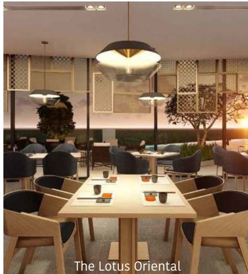
The Lotus Oriental