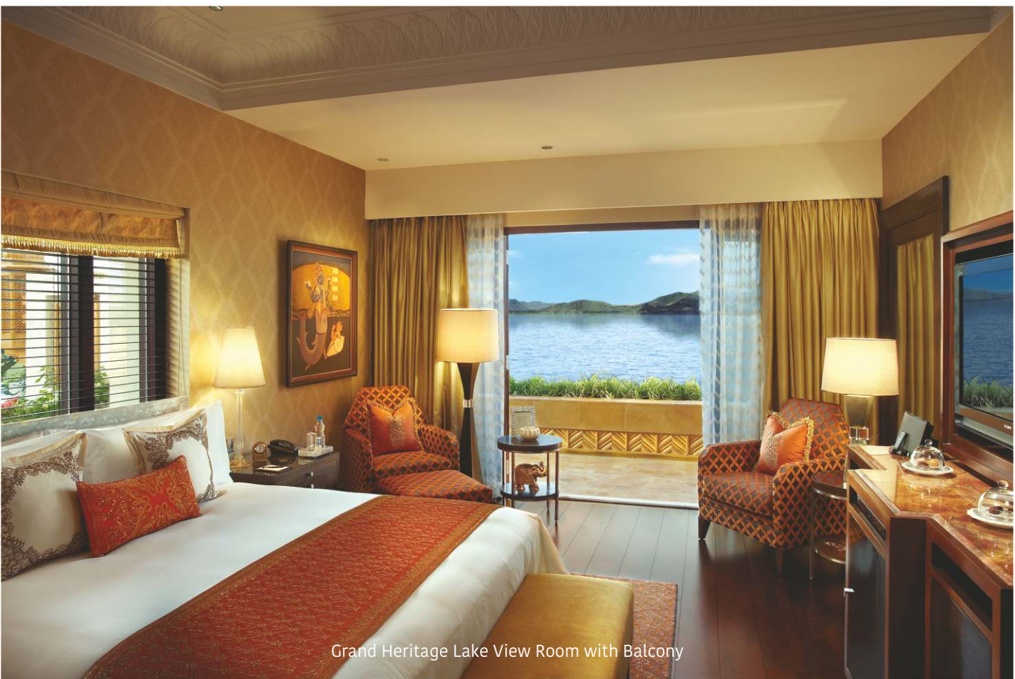
Grand Heritage Lake View Room with Balcony