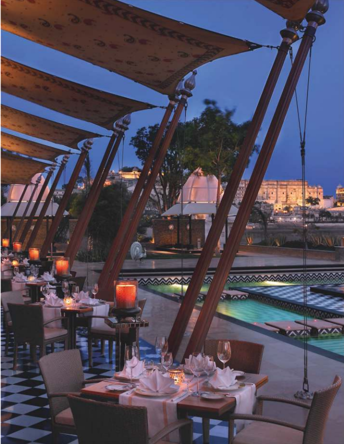
Al Fresco Dining