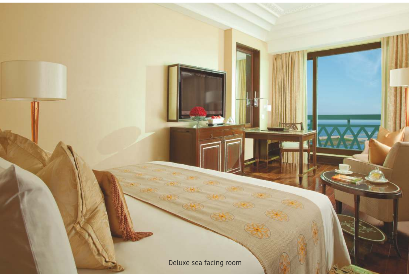
Deluxe sea facing room