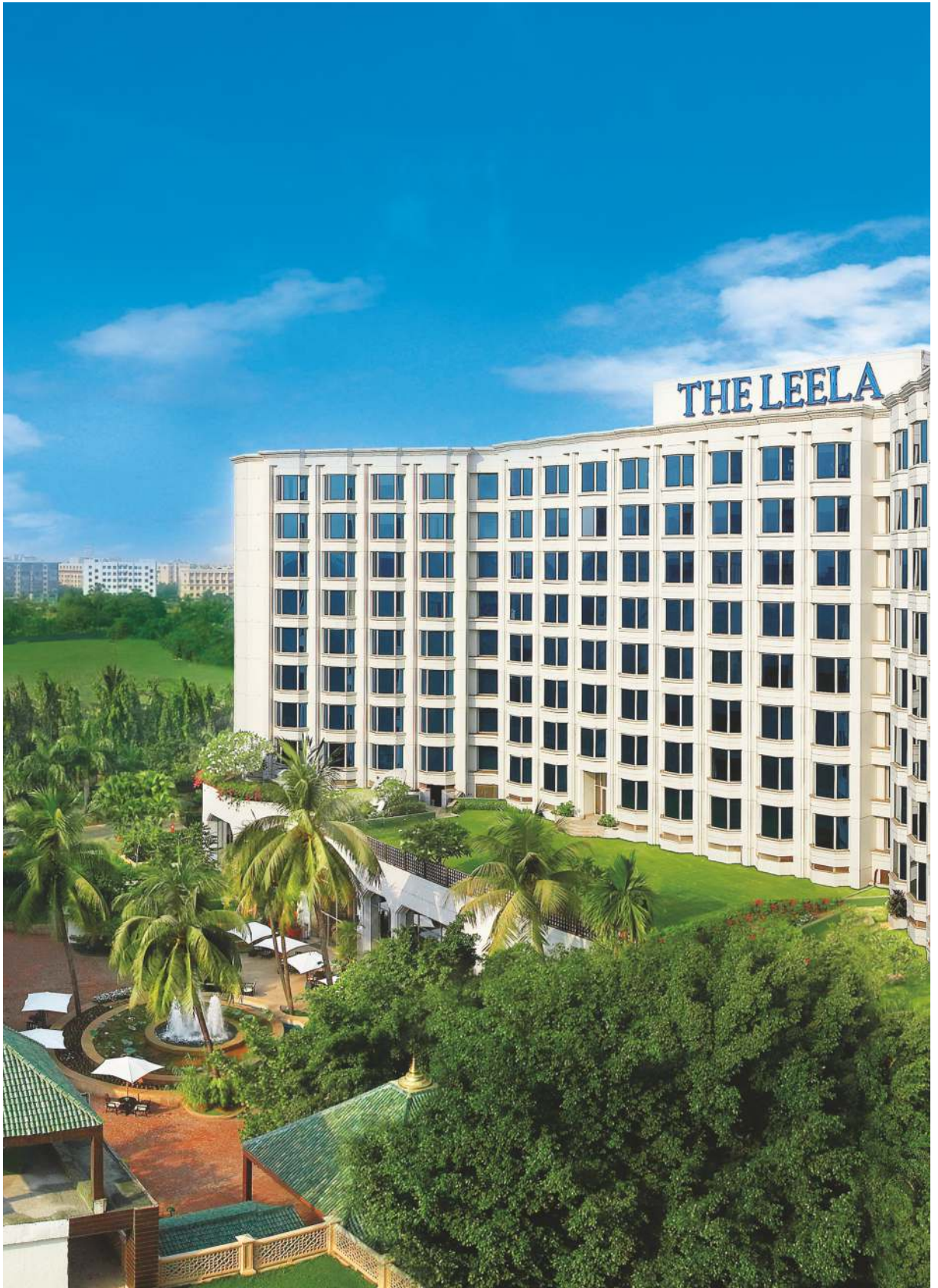
The Leela Mumbai