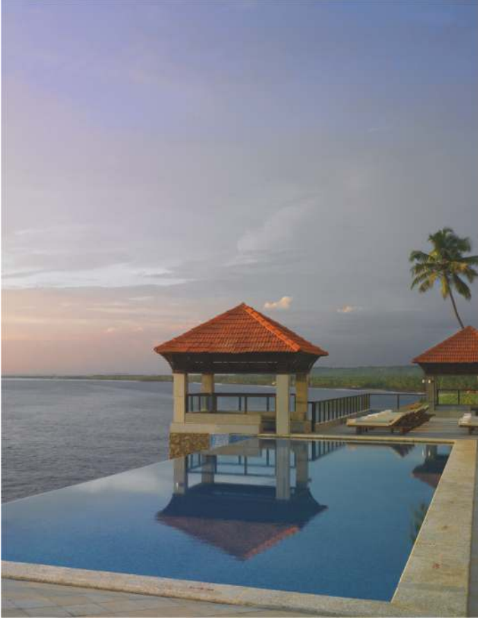
Infinity Pool at The Club