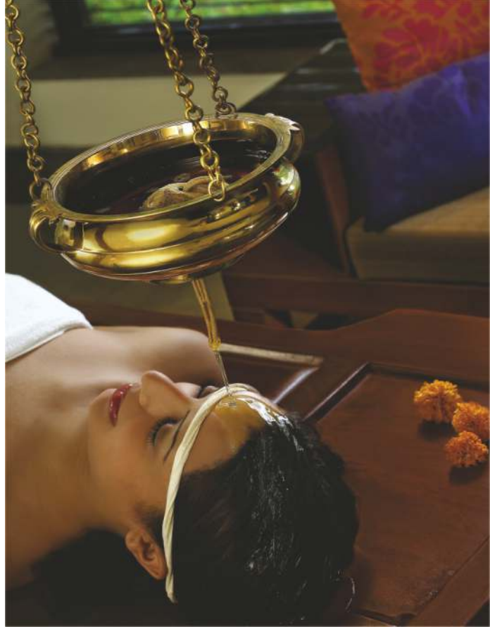
Ayurveda and Wellness Spa