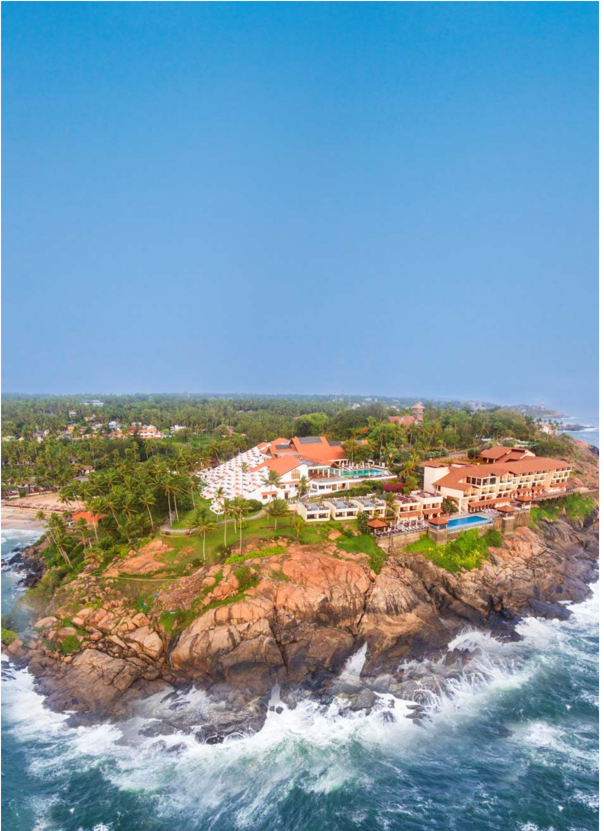
The Leela Kovalam, A Raviz Hotel