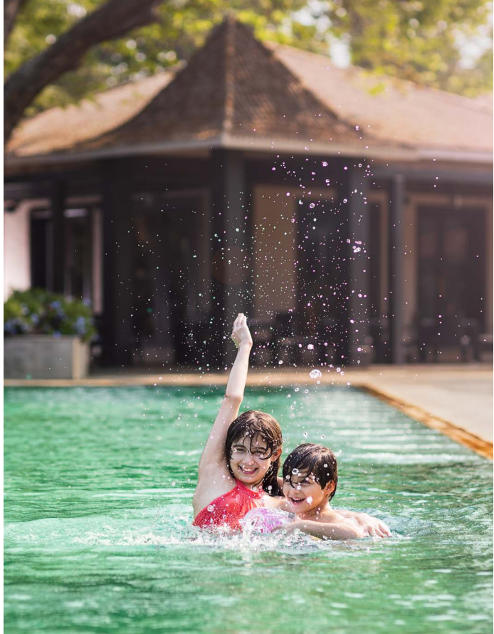
The Club Pool