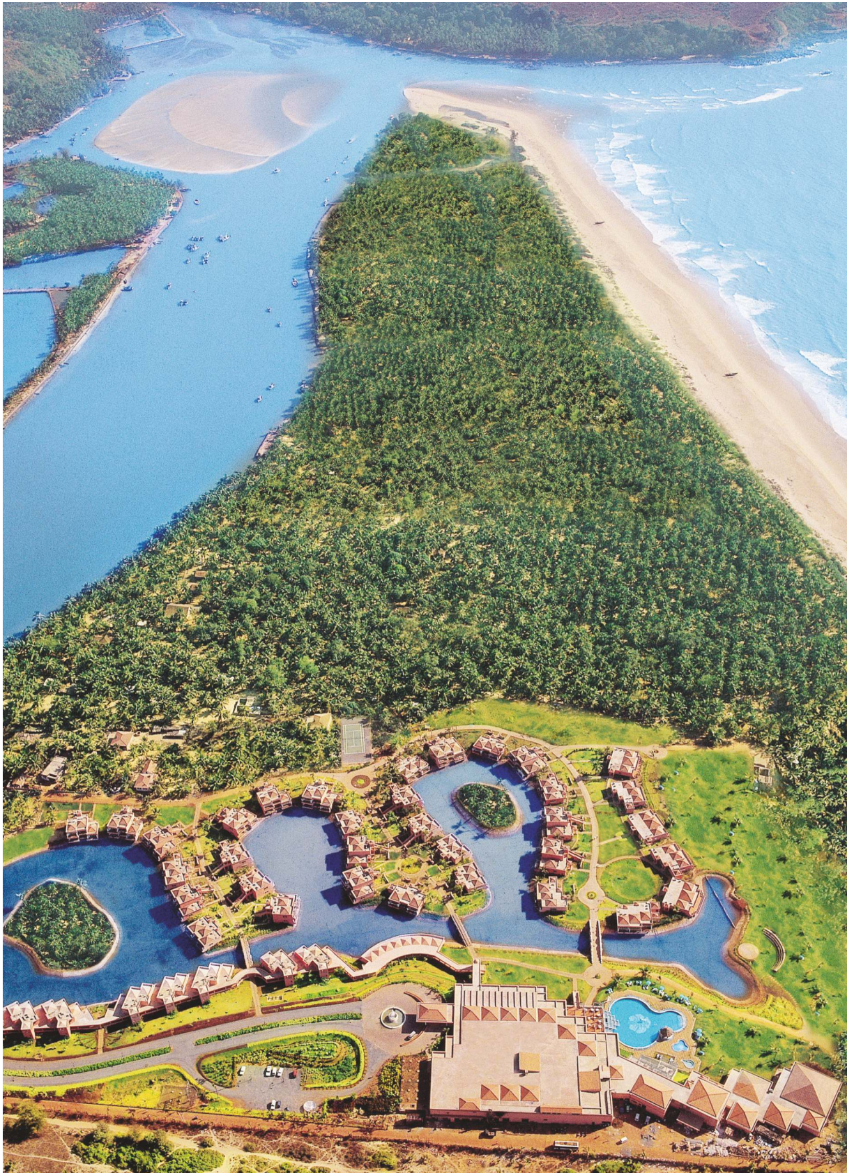
Aerial View - The Leela Goa