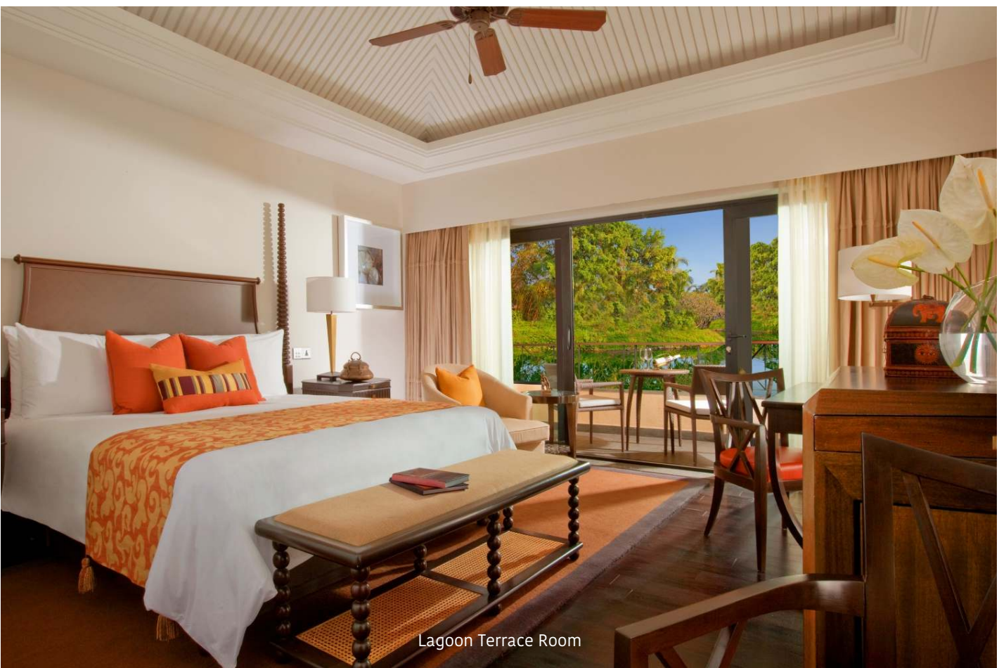
Lagoon Terrace Room