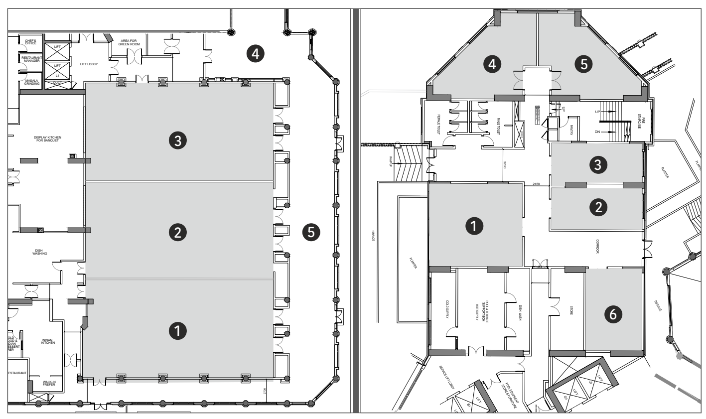
Grand Ballroom Lobby Level