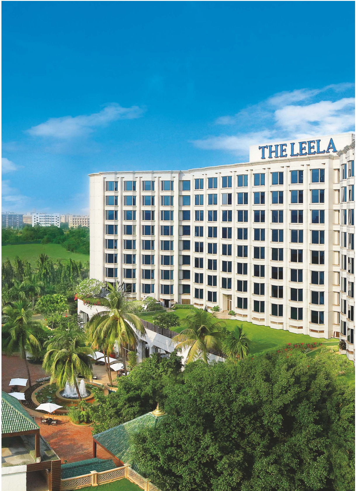
The Leela Mumbai