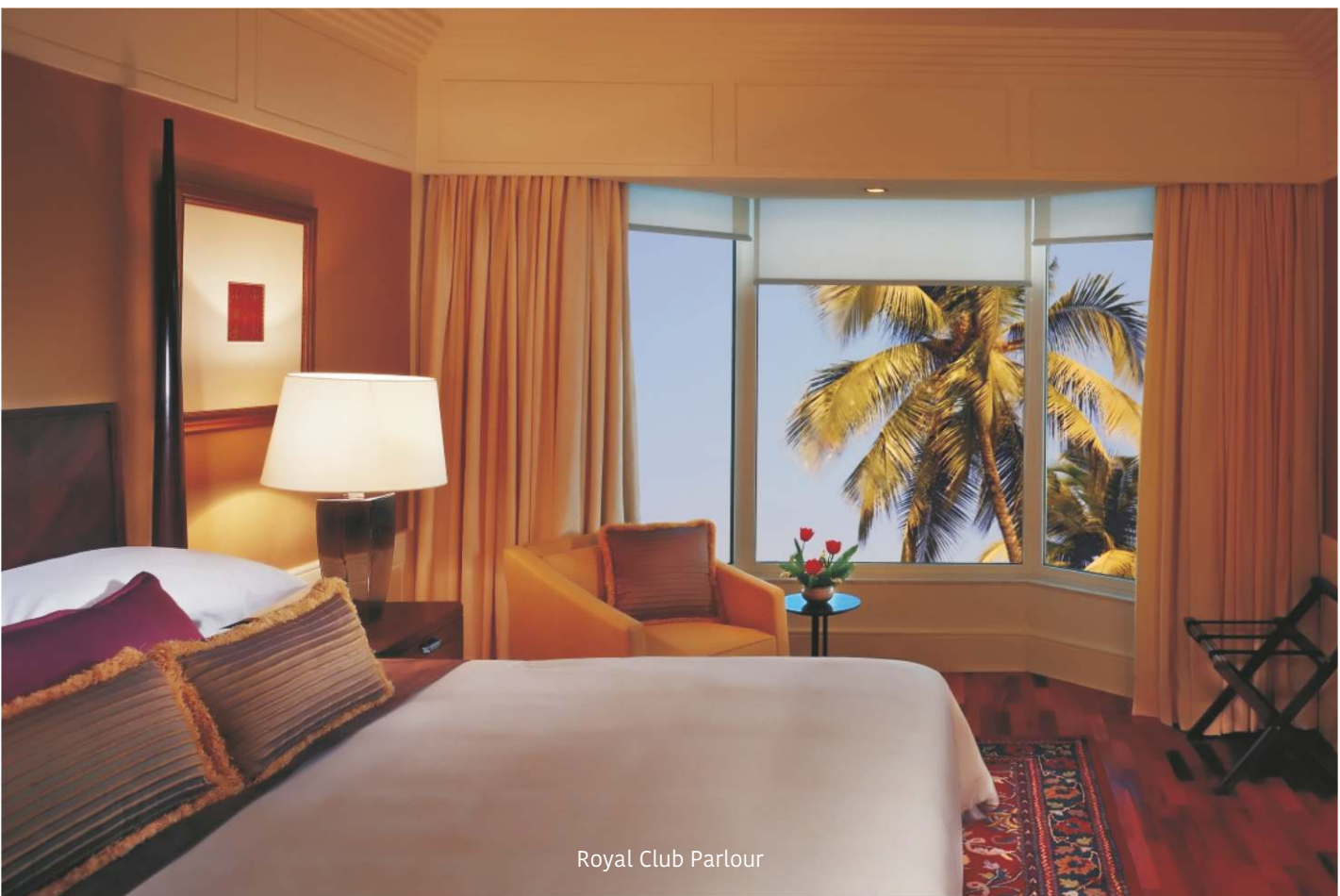
Royal Club Parlour