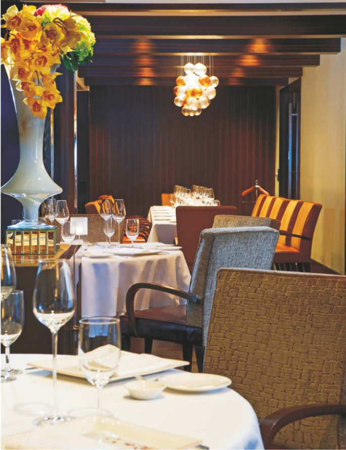
Le Cirque Signature