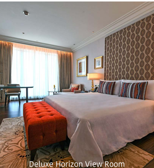
Deluxe Horizon View Room

Situated in the vicinity of Mahatma Mandir Convention and Exhibition Centre which is managed by The Leela and the Dandi Kutir Museum which showcases the life and teachings of Mahatma Gandhi.