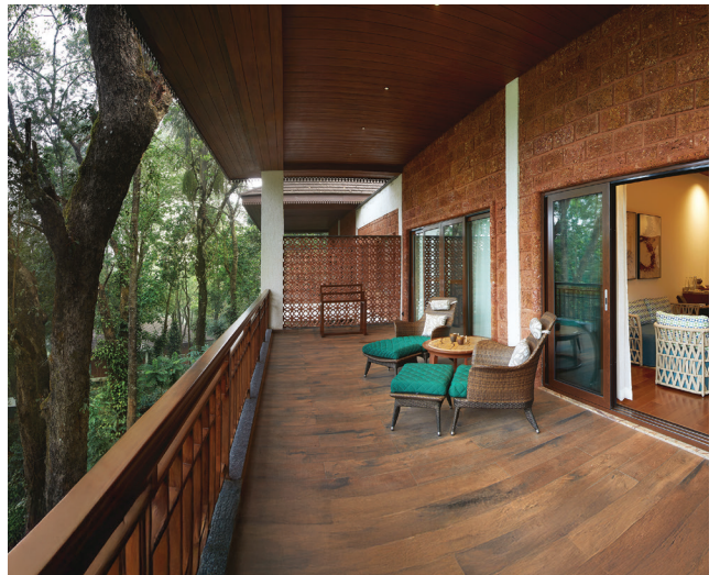
Riverstone Family Villas