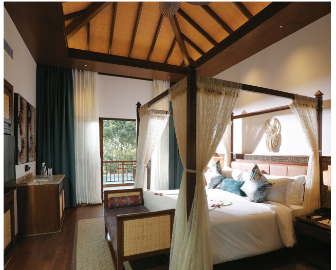
Mistwood Pool Villas