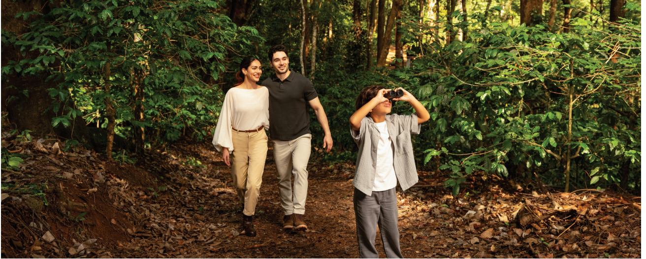
Guided forest trail experience at the sanctuary