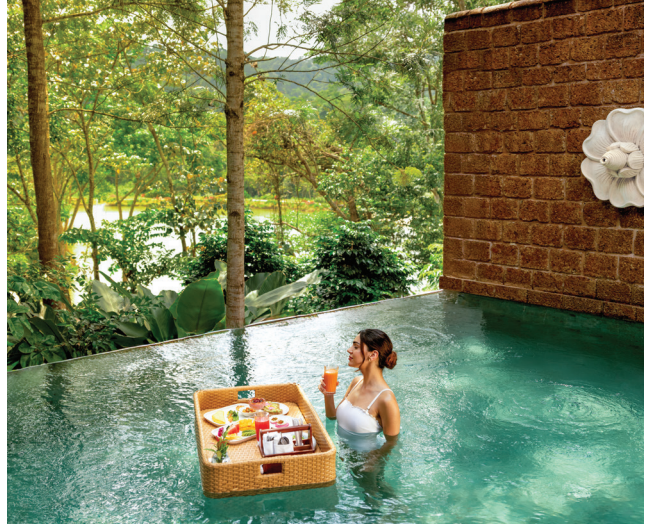
Forestlight Luxury Villas