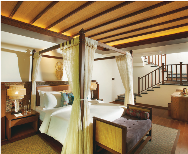
Windchimes Duplex Villas