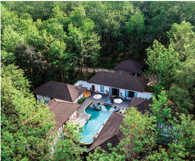
Sunbeam Presidential Villa