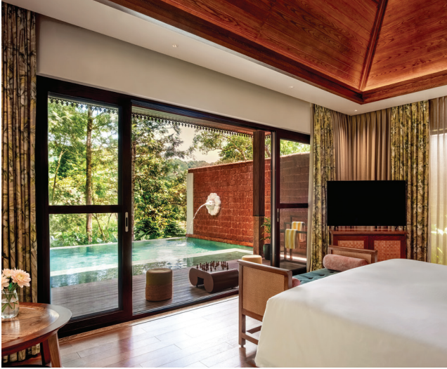
Forestlight Luxury Villas