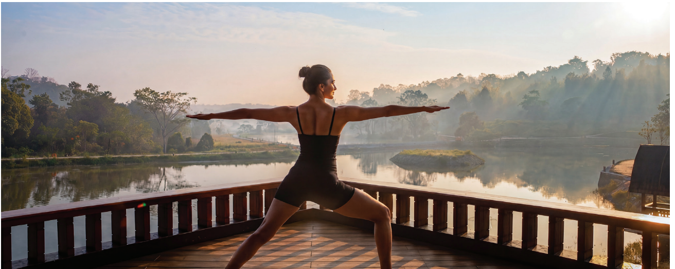
Vinyasa - Lakeside yoga deck