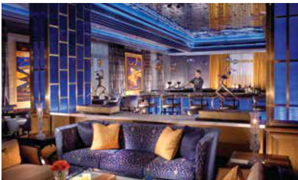
The Library Bar