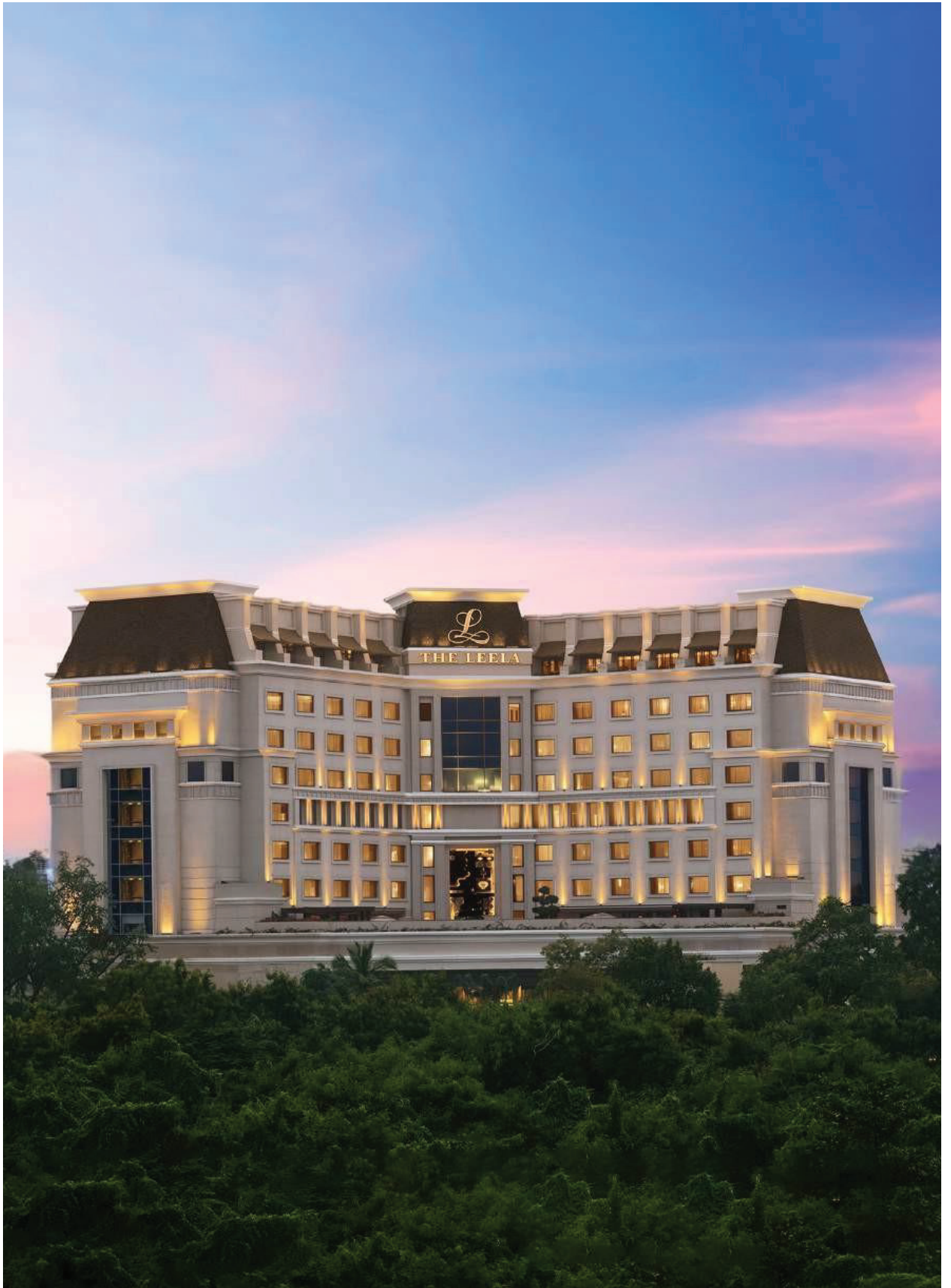
The Leela Hyderabad