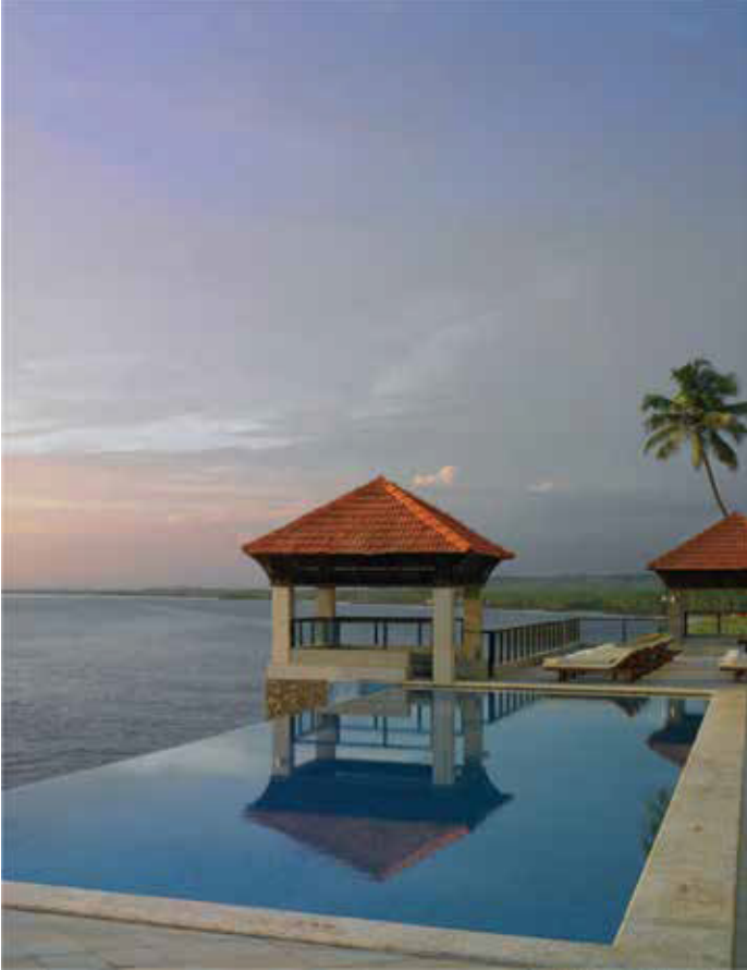
Infinity Pool at The Club