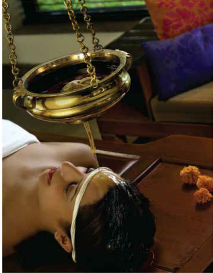
Ayurveda and Wellness Spa