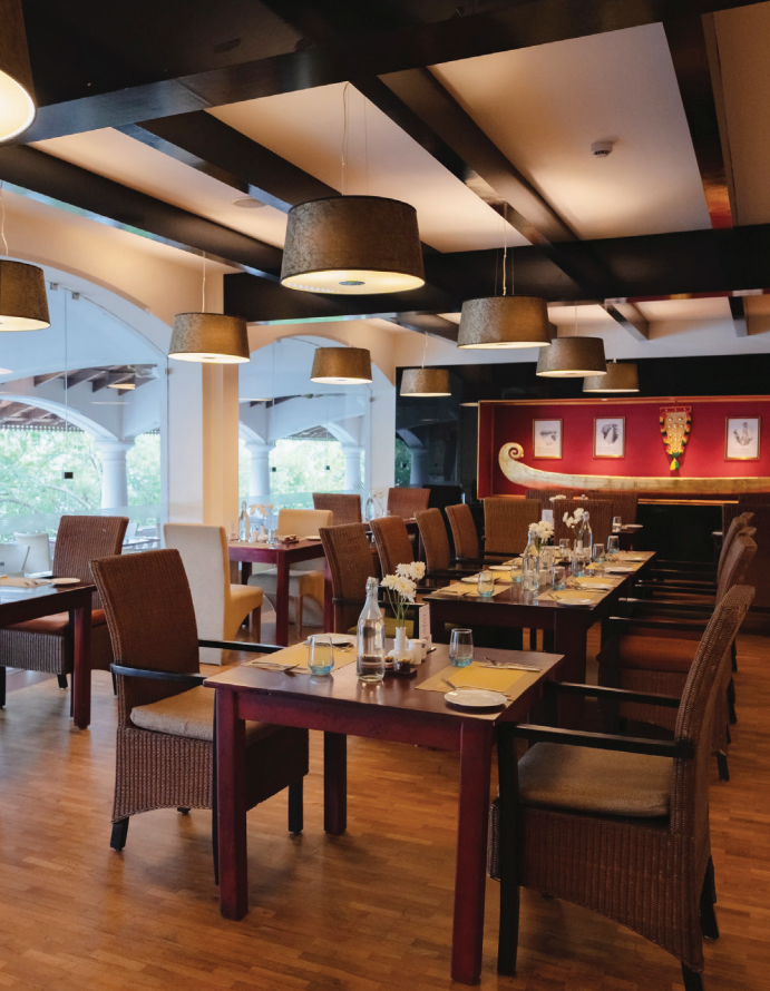
Keraleeyam - All-Day dining