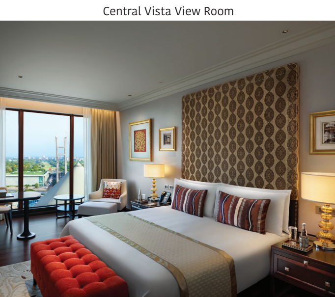
Central Vista View Room