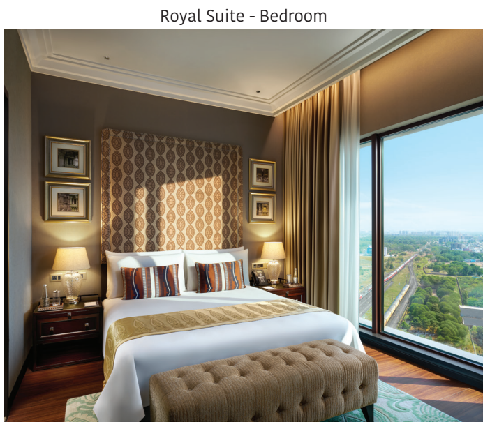
Royal Suite - Bedroom