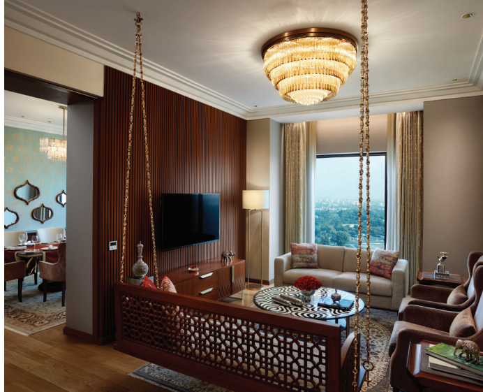
Presidential Suite - Living Room