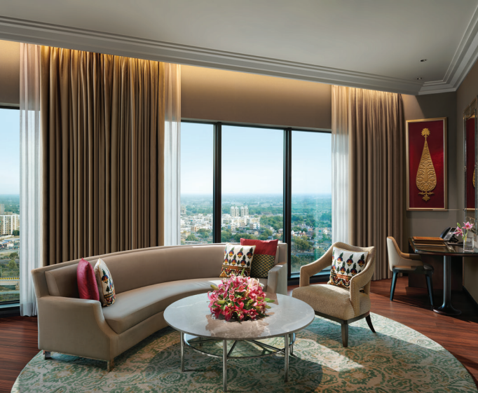
Royal Suite - Living Room