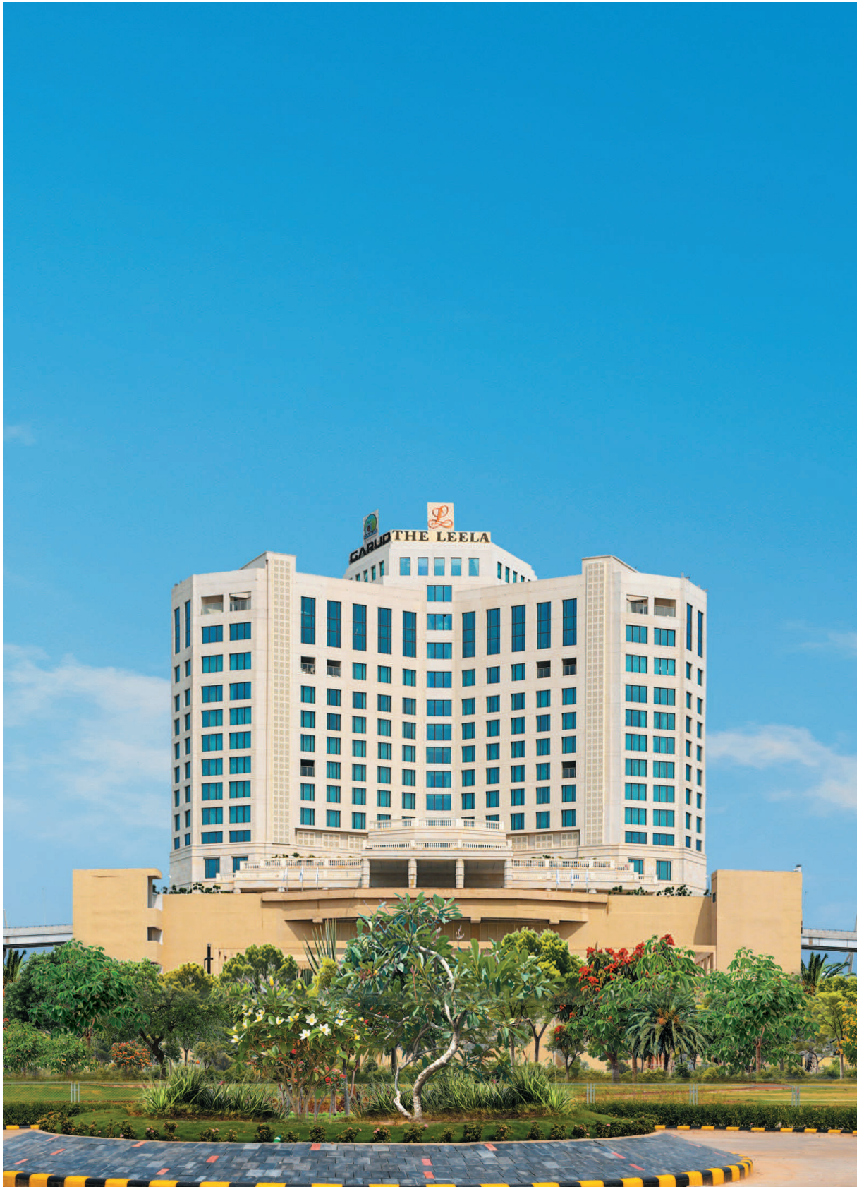
The Leela Gandhinagar