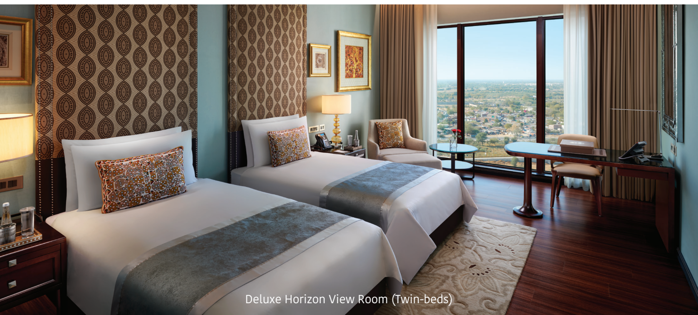
Deluxe Horizon View Room (Twin-beds)