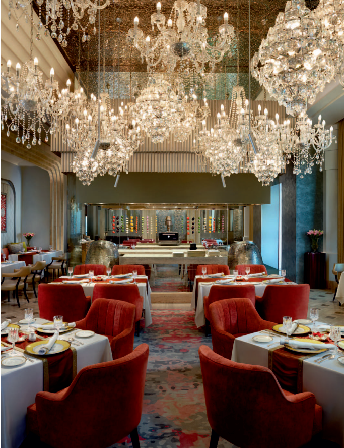
Diya-Indian Speciality Restaurant