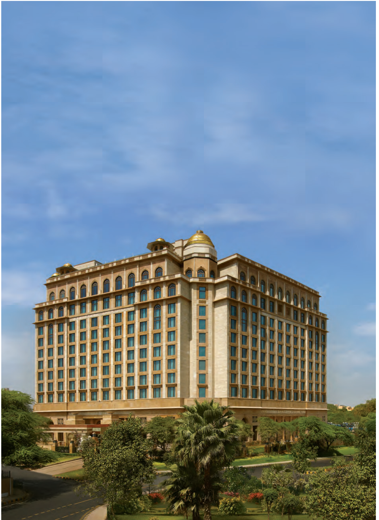
The Leela Palace New Delhi