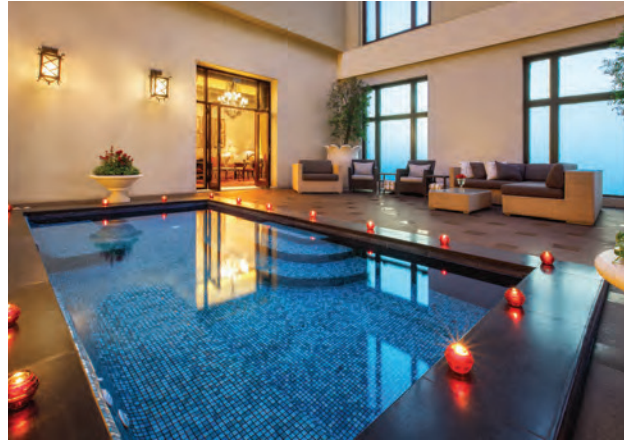
Royal Suite with Pool