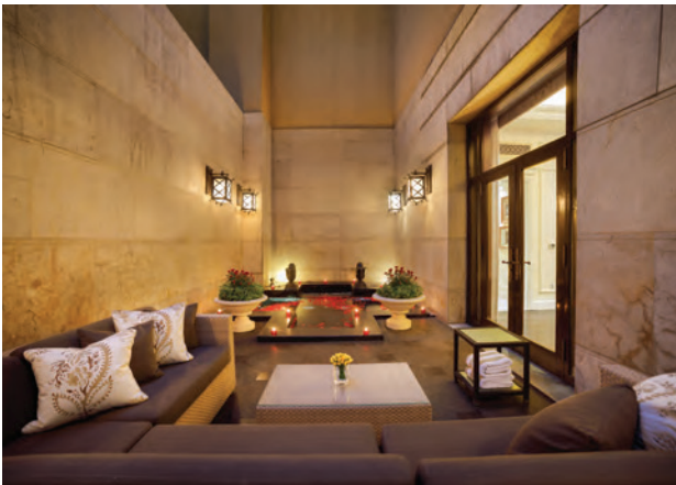
Grand Suite with Pool