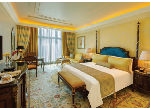
Royal Club Room