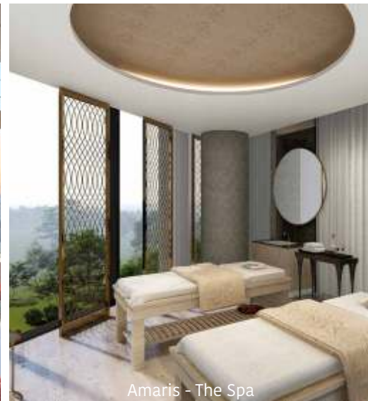
Amaris - The Spa