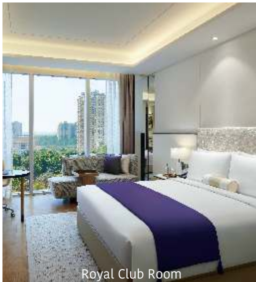
Royal Club Room

The Leela Bhartiya City, Bengaluru has 281 luxurious guestrooms and suites, extensive banqueting, and conferencing venues with multiple dining options. With proximity to uber chic retail outlets, commercial complexes, a centre for performing arts, and other entertainment options, the hotel is undoubtedly the preferred destination in North Bengaluru. A lavishly designed spa and a state-of-the-art fitness centre makes the hotel an ideal place to stay for a hophophile.