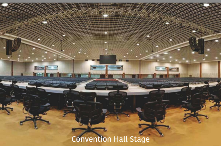
Convention Hall Stage