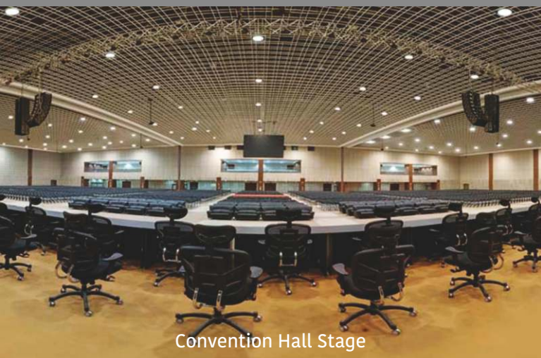
Convention Hall Stage