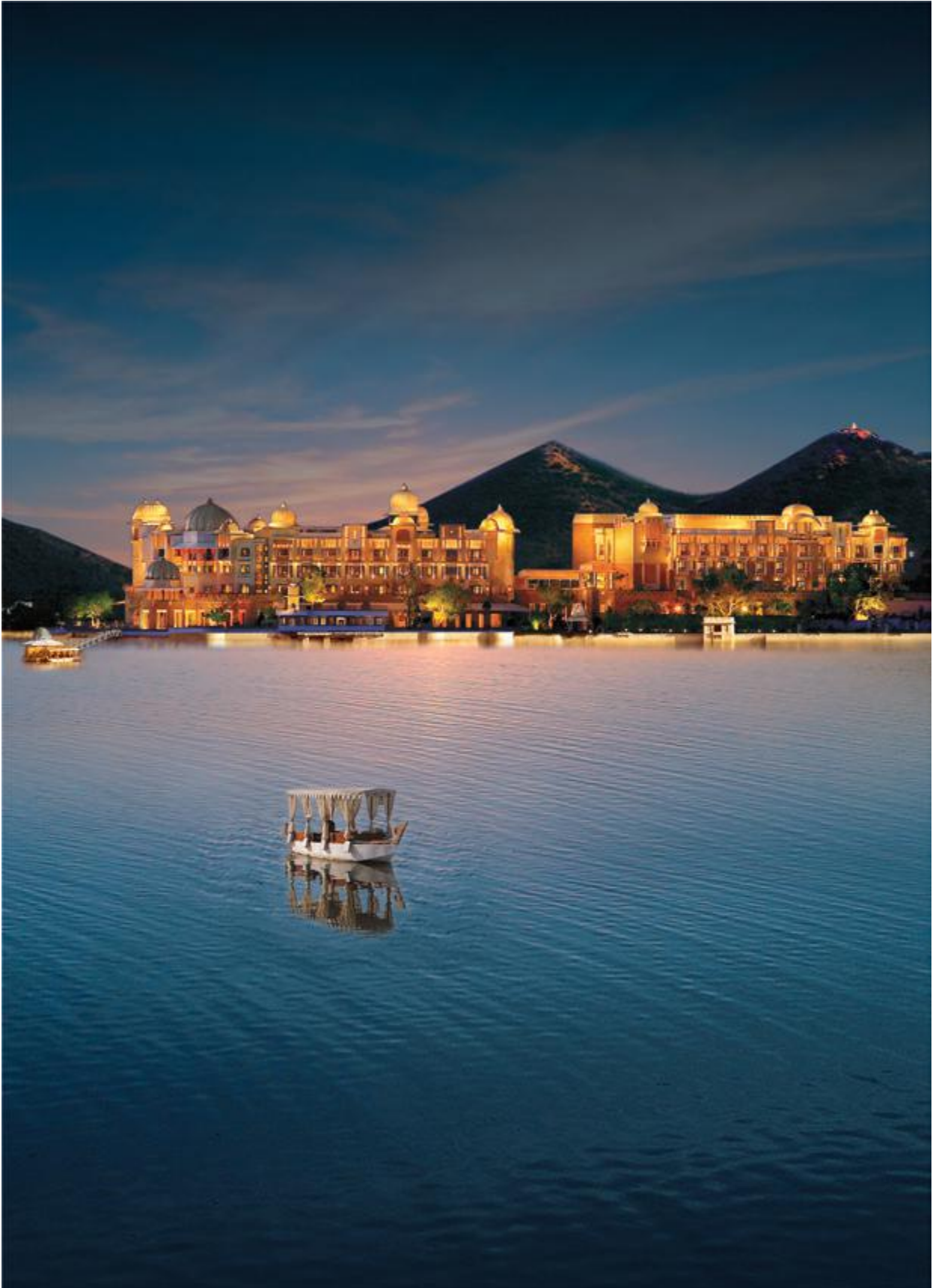
The Leela Palace Udaipur