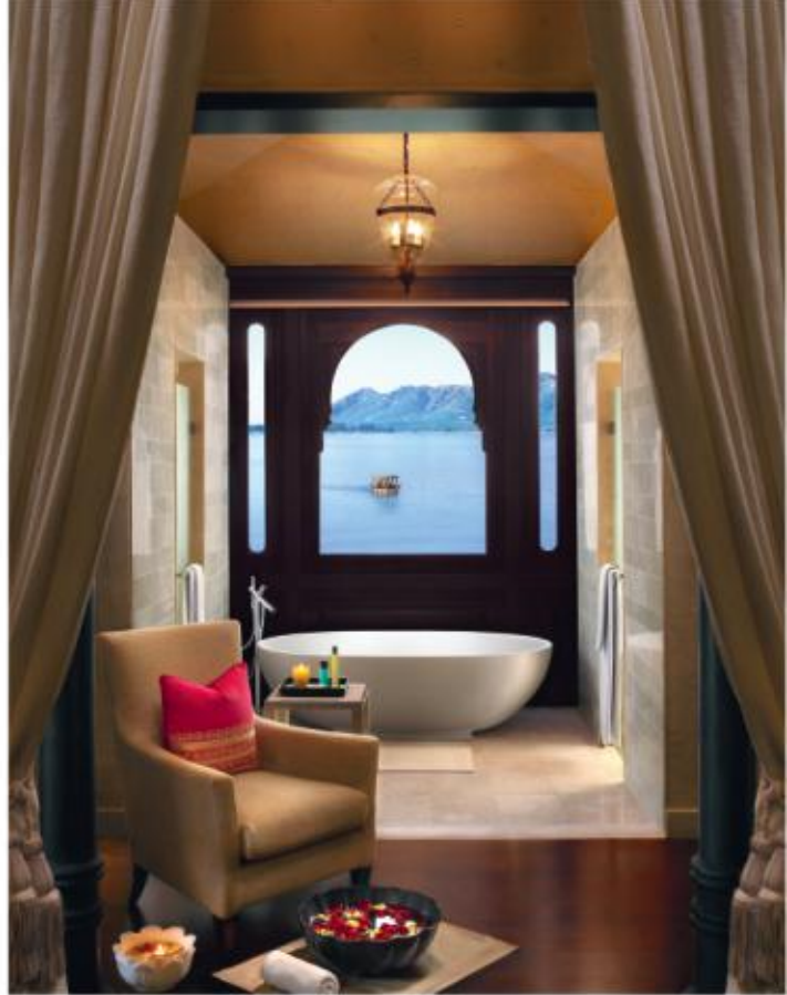
Spa by ESPA