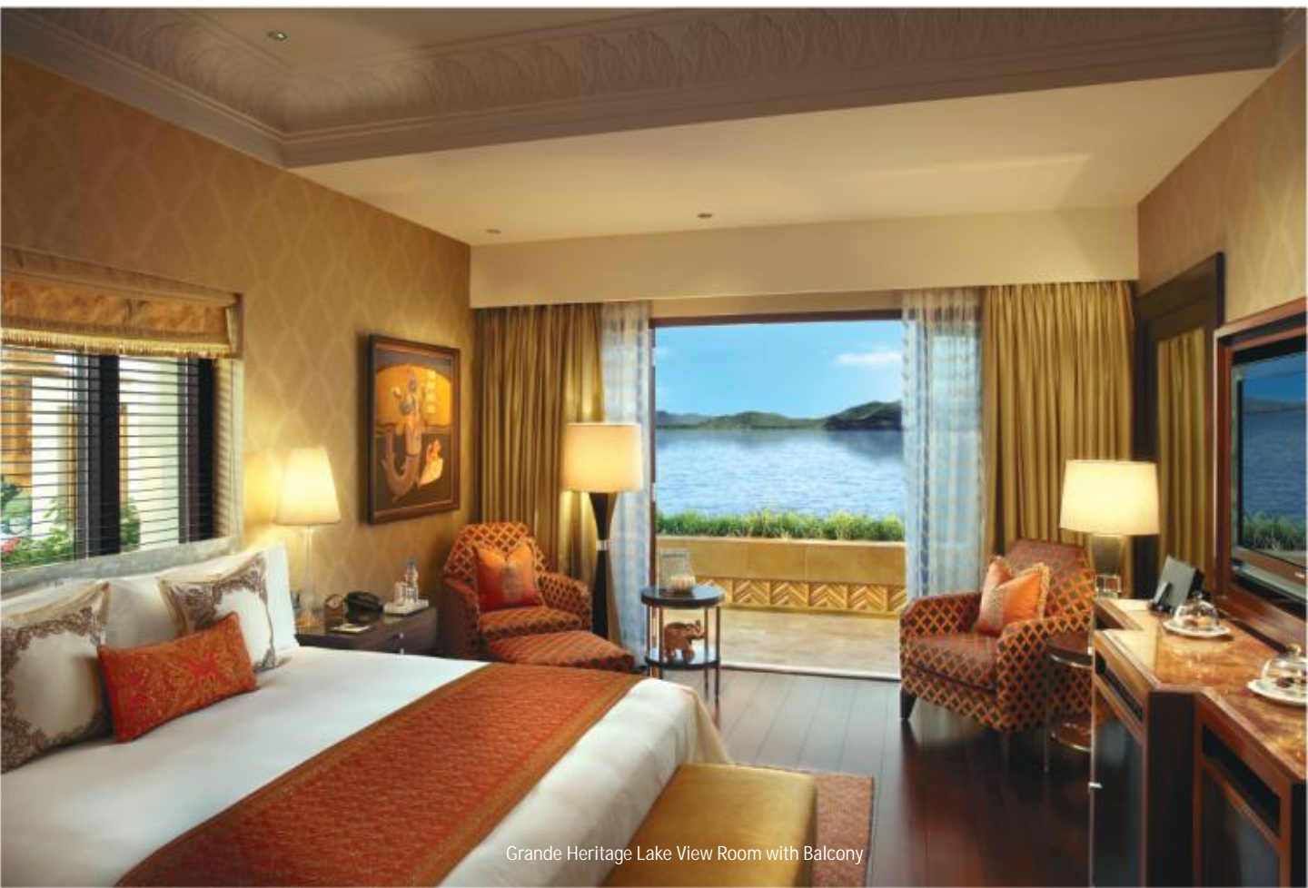
Grande Heritage Lake View Room with Balcony