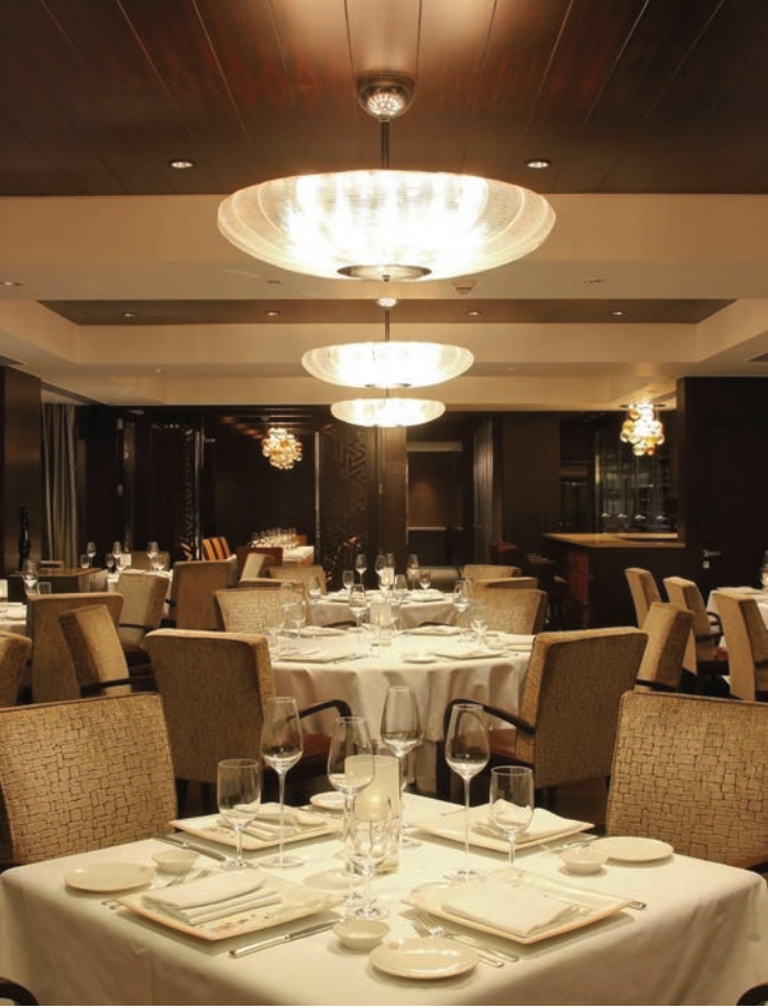
Le Cirque Signature