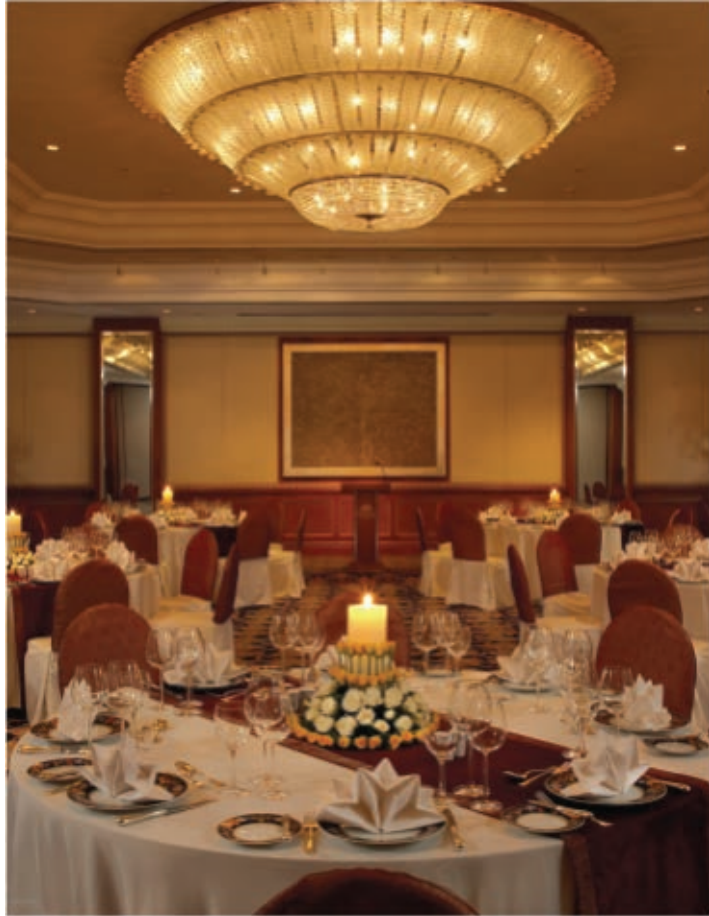
The Grand Ballroom