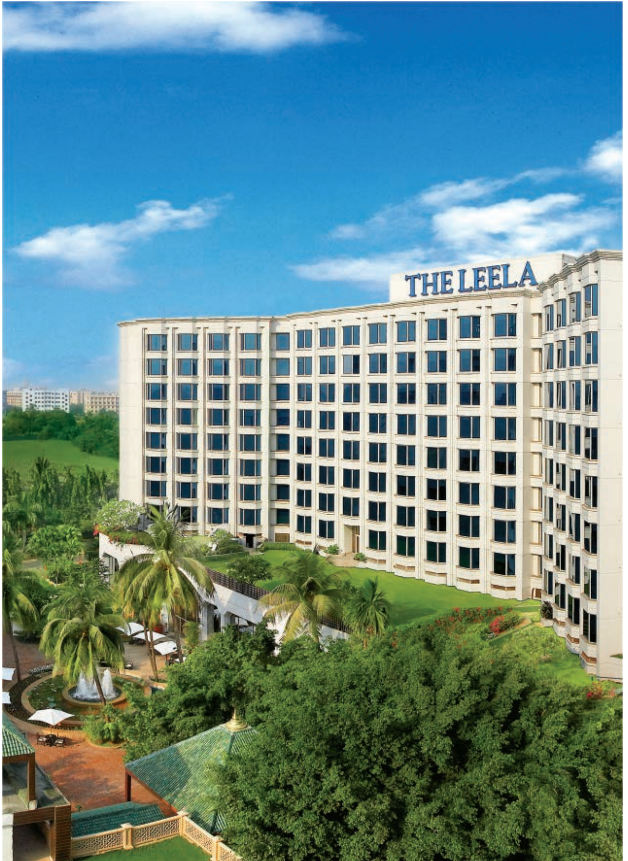
The Leela Mumbai