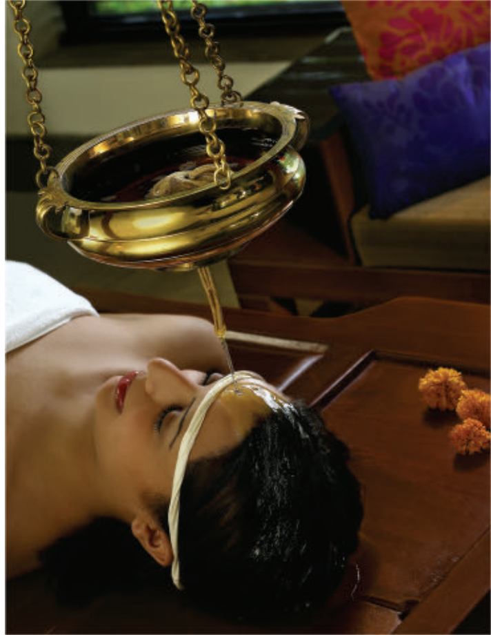
Ayurveda and Wellness Spa