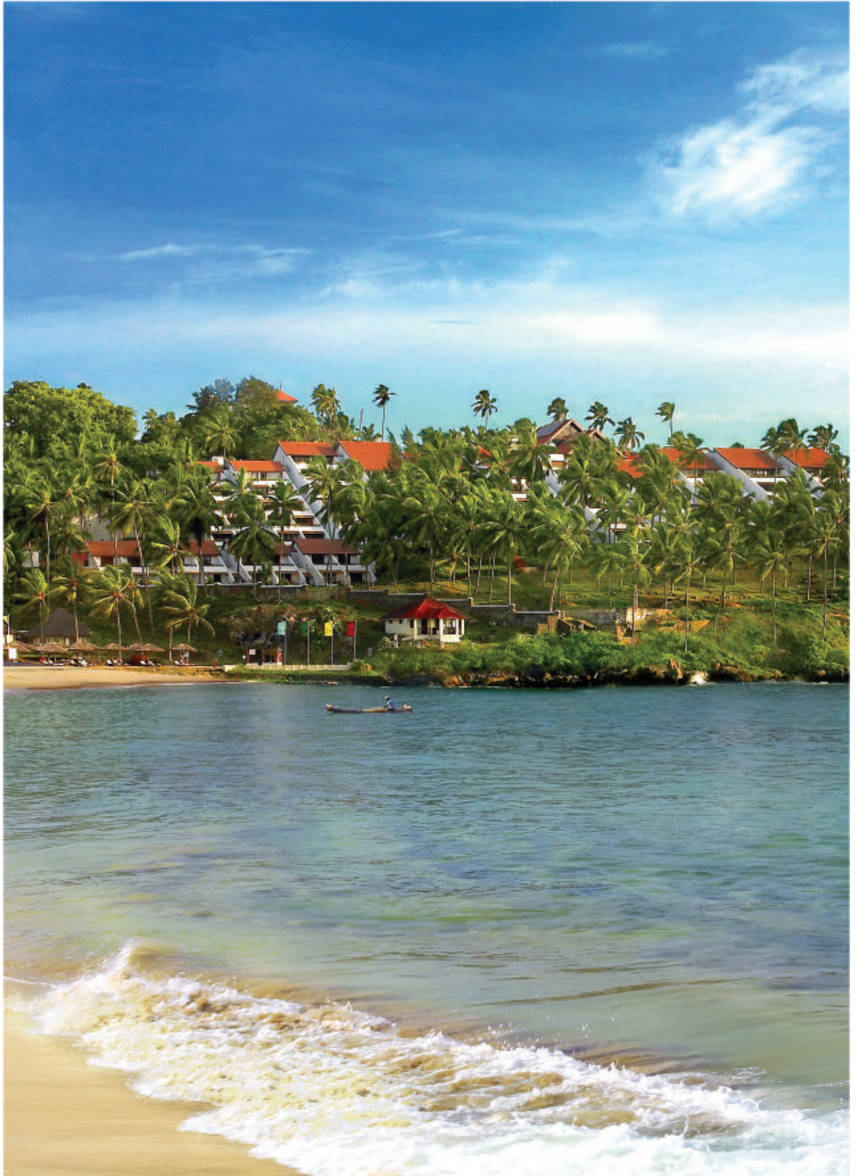
The Leela Kovalam