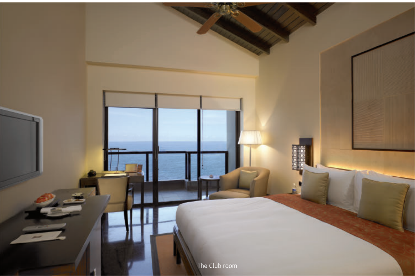
The Club room