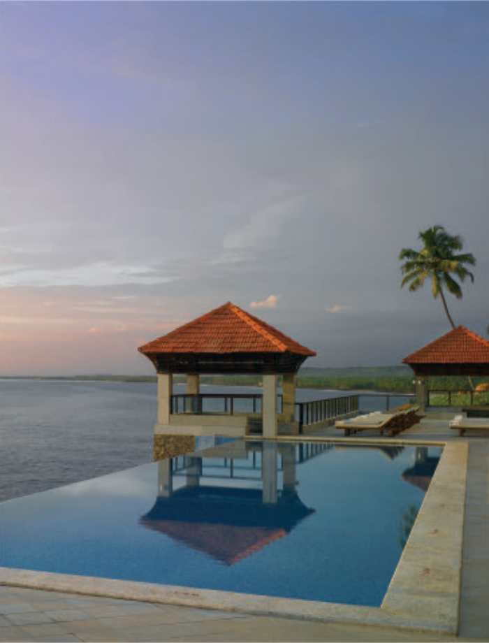
Infinity Pool at The Club