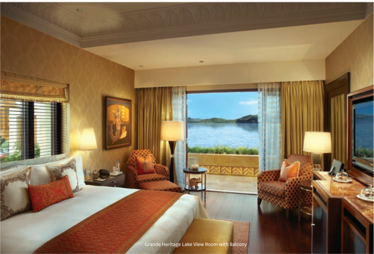
Grande Heritage Lake View Room with Balcony