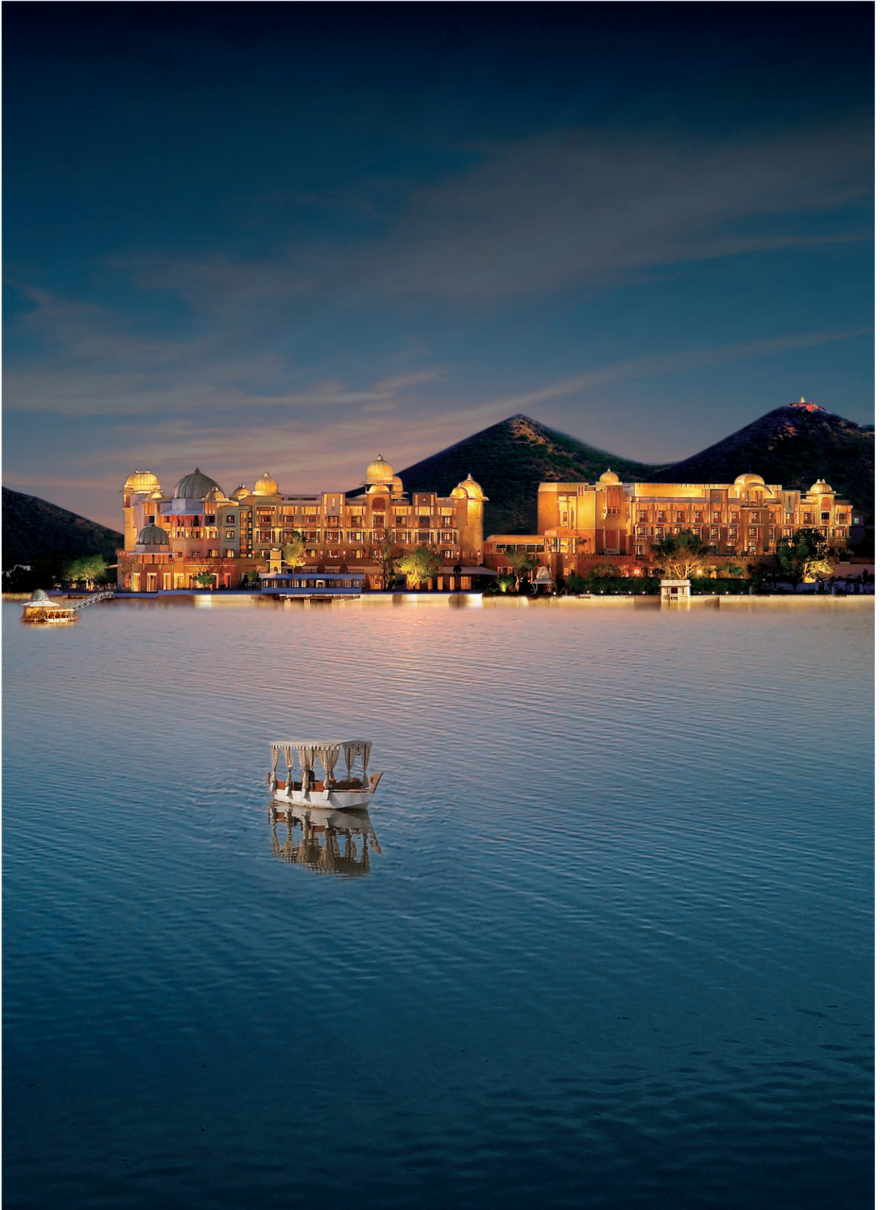
The Leela Palace Udaipur