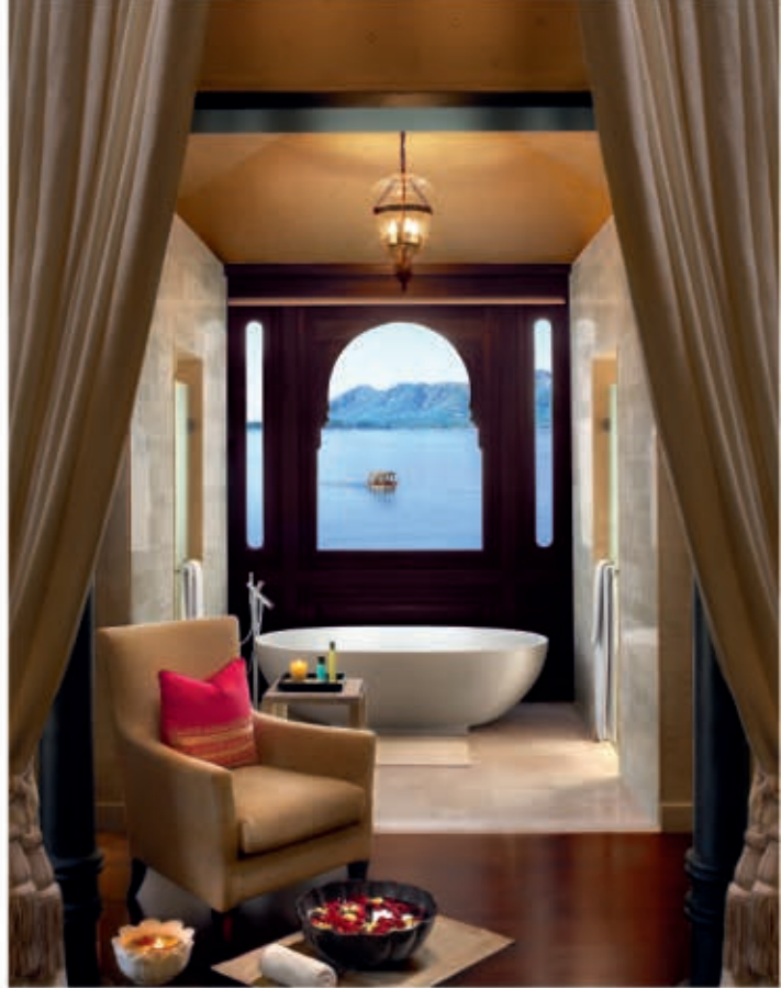
Spa by ESPA