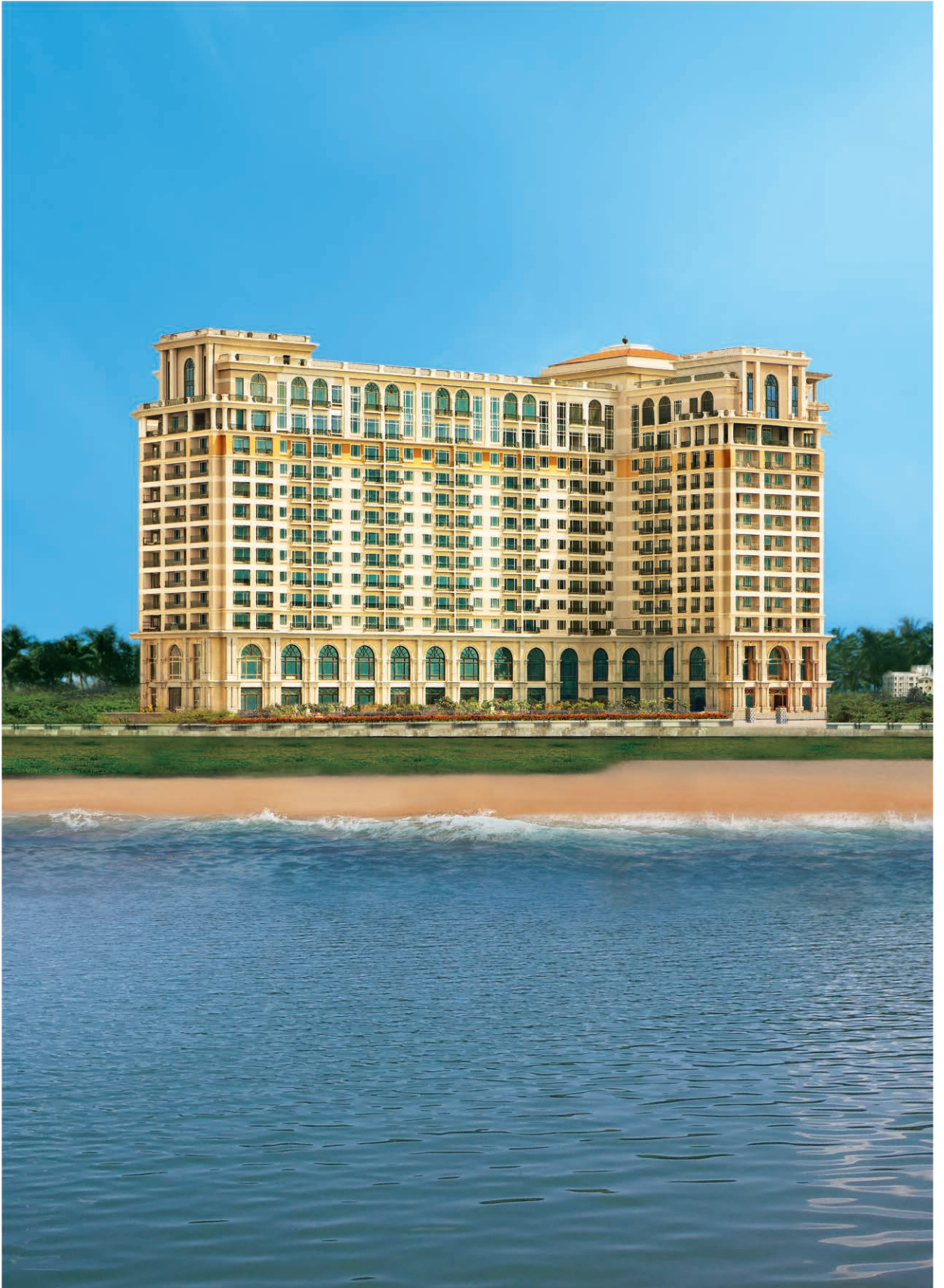
The Leela Palace Chennai