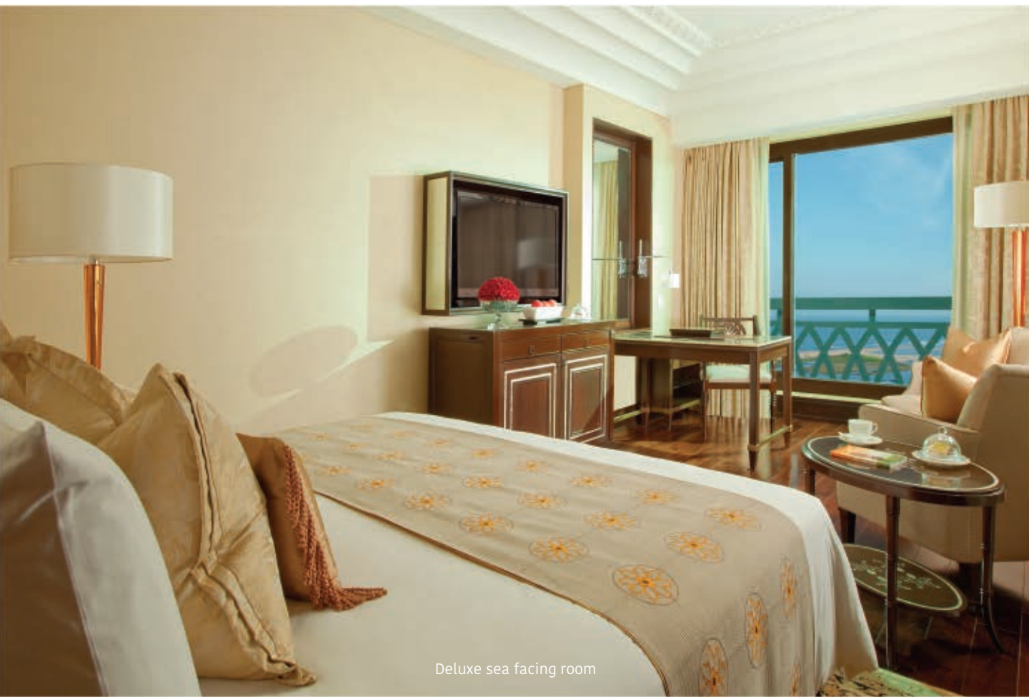
Deluxe sea facing room