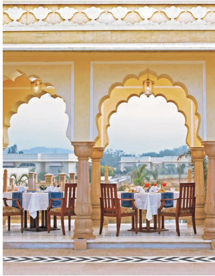
Shahi Bagh Promenade