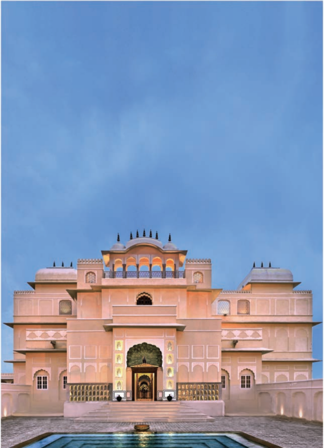
The Leela Palace Jaipur