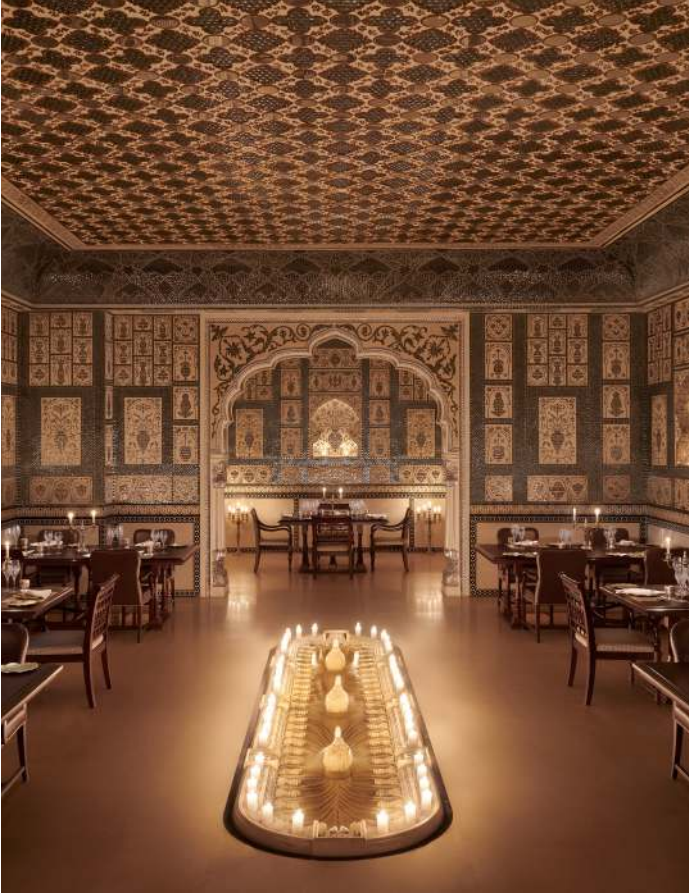
Mohan Mahal - Indian Speciality restaurant