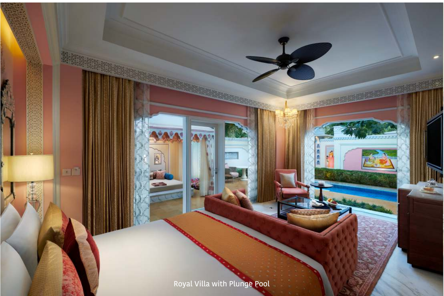
Royal Villa with Plunge Pool