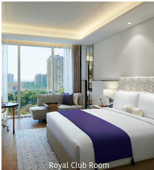
Royal Club Room

The Leela Bhartiya City, Bengaluru has 281 luxurious guestrooms and suites, extensive banqueting, and conferencing venues with multiple dining options. With proximity to uber chic retail outlets, commercial complexes, a centre for performing arts, and other entertainment options, the hotel is undoubtedly the preferred destination in North Bengaluru. A lavishly designed spa and a state-of-the-art fitness centre makes the hotel an ideal place to stay for a hophophile.