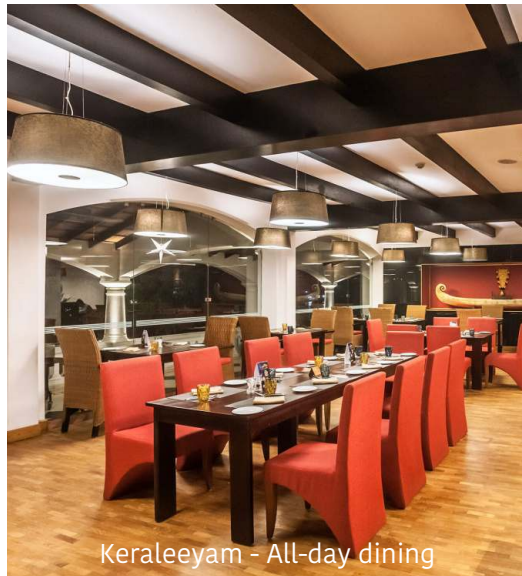
Keraleeyam - All-day dining